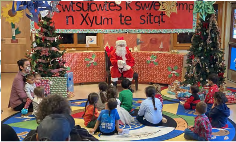
LFN Winter Solstice Celebrations