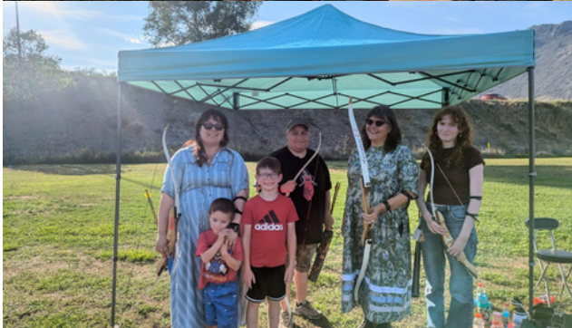
Above: Students help raise the museum tent (before the storm...)